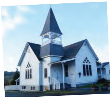
Hillside Bible Church, a historic church in northwest Oregon, before the fire.

It is difficult to tell a story like this one.