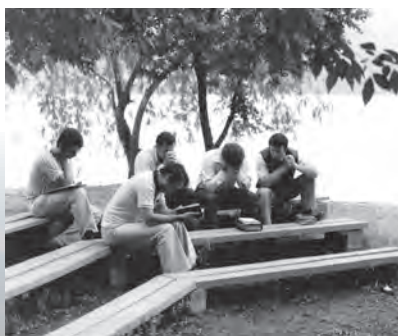
Village Missionaries pray together in the 1970s.

Village Missions began with a simple idea. People in rural places need Jesus. After 50 years of ministry in Canada, rural ministry is more important than ever.