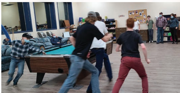
Kids from Boyle Gospel Chapel play a game during youth group.

have been attending. They all enjoy it and are even bringing their friends. After not having any youth activities in our community for the past two years, kids seem to have really latched on to this. We are excited to see kids coming through the doors of the church!